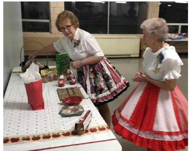
Johnny Appleseed Dance