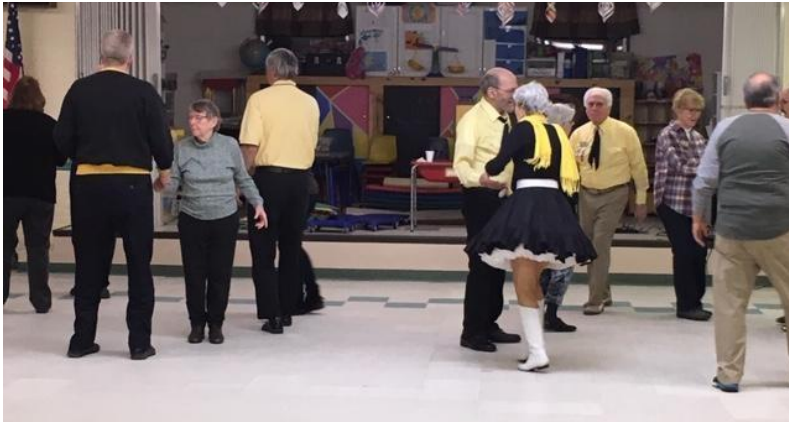
Black & Gold Dance