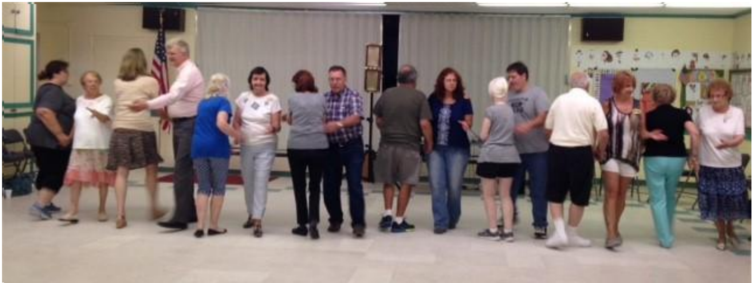
World Population Dance