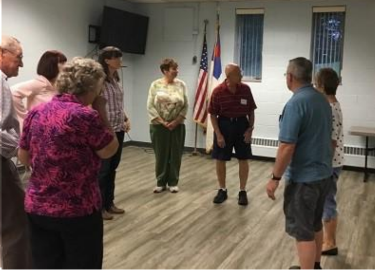
Friendly's Open House