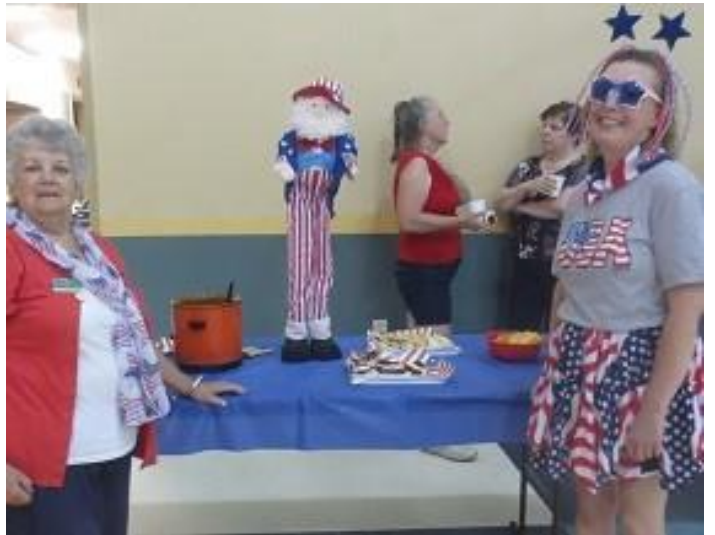
Red White & Blue