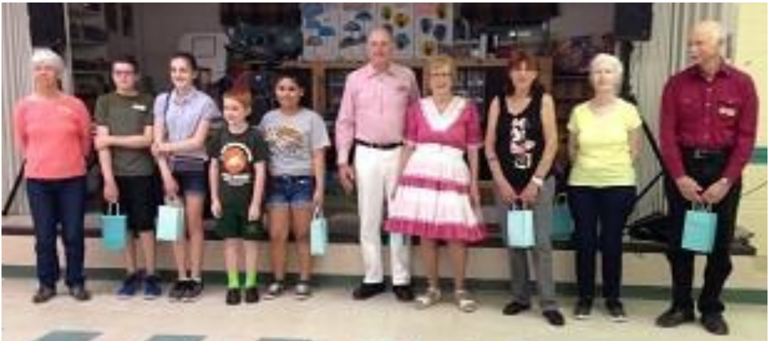
Graduates May 2018