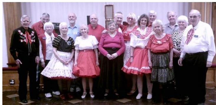
Happy-Go-Lucky's Valentine Dance

When you read this article, it will be spring. Hopefully by now, we are enjoying warm weather. Who ever heard of 70 degree weather in January & February? That was some winter